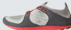
WW10MM GREY | RED