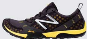
MT10GY GREY | YELLOW