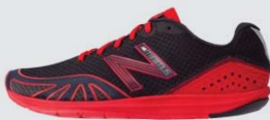
MR10BR BLACK | RED